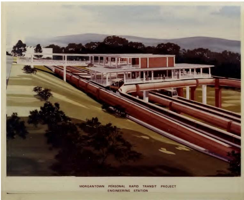
Construction of Morgantown (WV) Personal Rapid Transit system