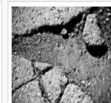
> On-road measurement