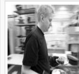
> Road material laboratory, services