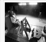
> Crash safety testing