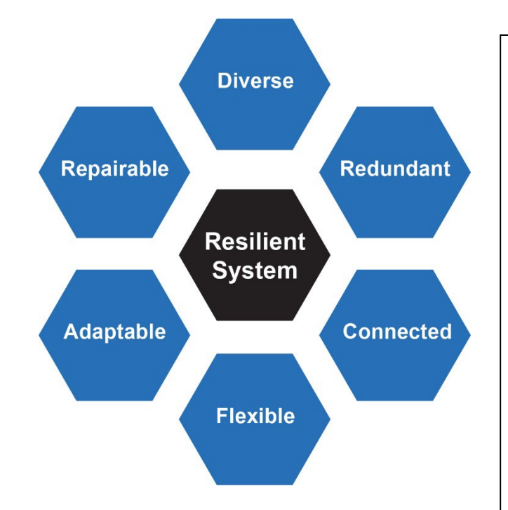
Figure ES-1: Properties of a Resilient System